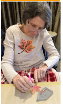
Diamond Dot Painting

During this holiday season when we reflect on everything God has placed in our lives, we have the unique opportunity to emphasize giving thanks. Believing in God allows us to be thankful when things go well and patient when things go against us. It is crucial when things are going against us to thank God for granting us the learning experience he has placed in front of us.