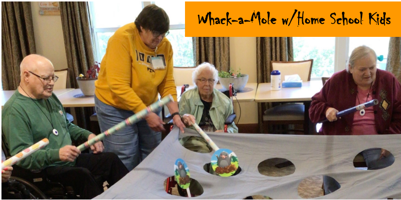
Whack-a-Mole w/Home School Kids