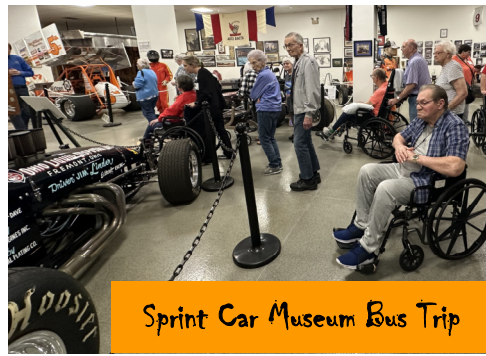
Sprint Car Museum Bus Trip

Autumn Door Decorating Contest *Independent Living Apt #215 *Assisted Living Apt #219 *Elim Garden Apt #118 *HCC Room # 28